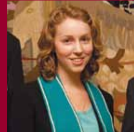
Scripps College Class of 2009

“Using the knowledge and technical skills gained through the Scholars Program to help non-profit institutions is deeply fulfilling, and I am energized by my diverse and committed colleagues.”