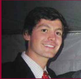
Clarmont McKenna College Class of 2010

“Despite the fact that I am a Philosophy major, the Robert Day Scholars program has been a phenomenal opportunity for me to learn how to interpret the prodigiously important economic and financial events of the current day.”