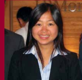
Pomona College Class of 2011

"I did not know there were so many Claremont College alumni in Asia! Before the RDS Asia Networking Trip, I never considered contacting alumni in Asia, but now I have hundreds of contacts."