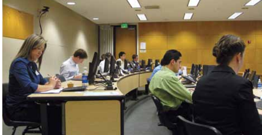
▲ Applicants participate in the in-box portion of the Leadership Assessment

All applicants are expected to be available for each progressive stage of the application process. Students studying off-campus participate in alternate, but comparable activities.